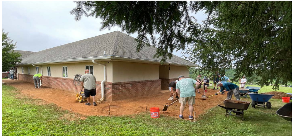
LifePoint Loves volunteer group building a patio space for Addiction Healing patients.

That same spirit of commitment drives others in the church to connect in a different way. A dedicated group of Faith Family volunteers visit weekly to lead our residents through an enriching Bible study program — a highlight the men look forward to as a meaningful part of their ongoing journey.