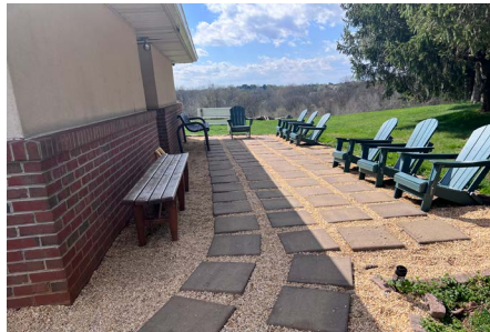
Finished LifePoint Loves patio space.