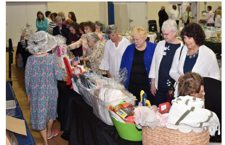
Ladies Tea in 2025, supported by Faith Family Church.